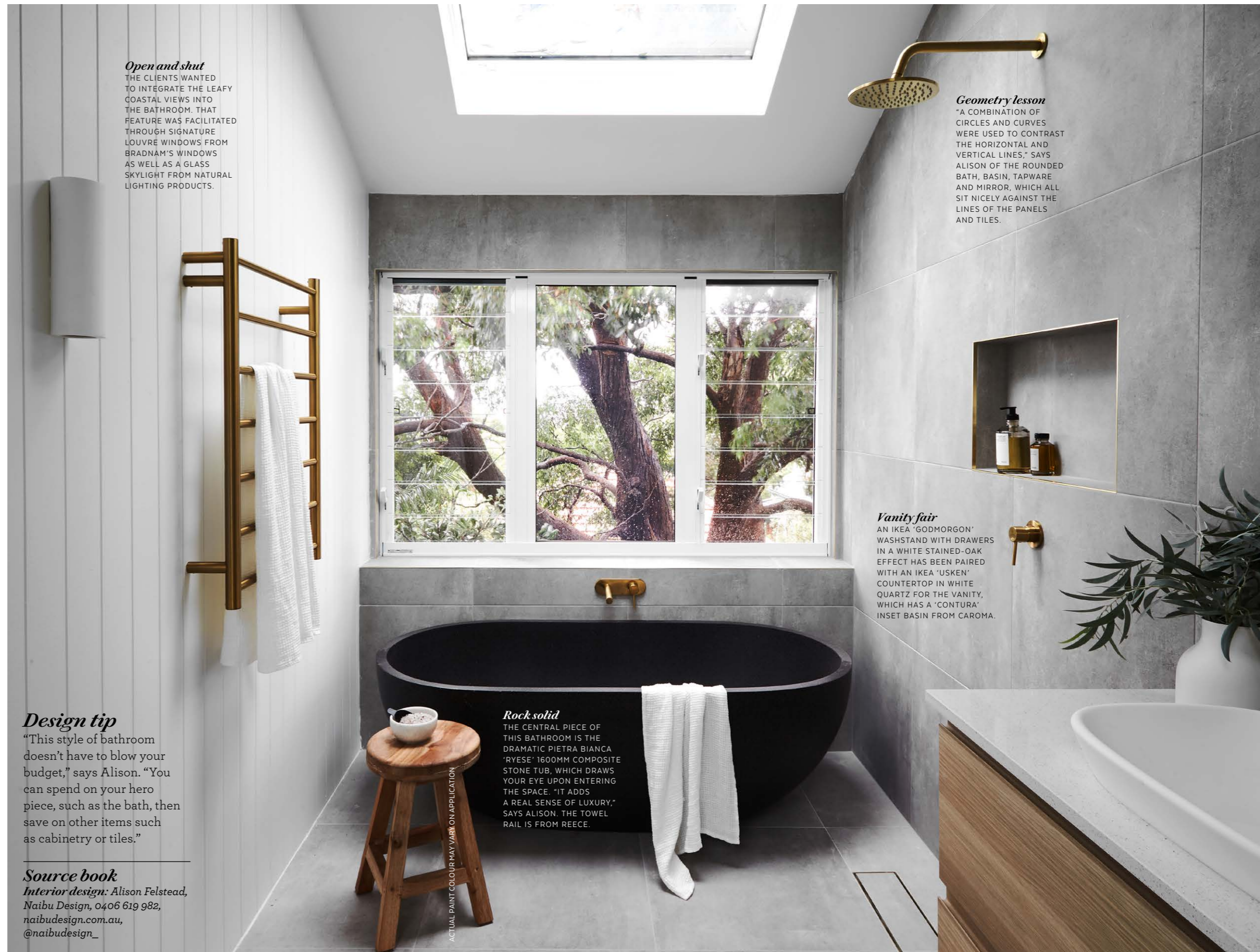
ACTUAL PAINT COLOUR MAY VARY ON APPLICATION